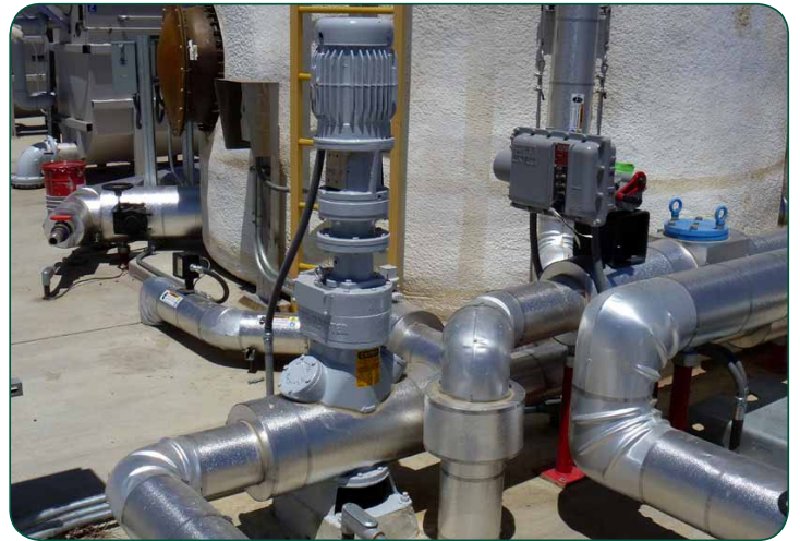
A Muffin Monster grinder in a grease receiving line.