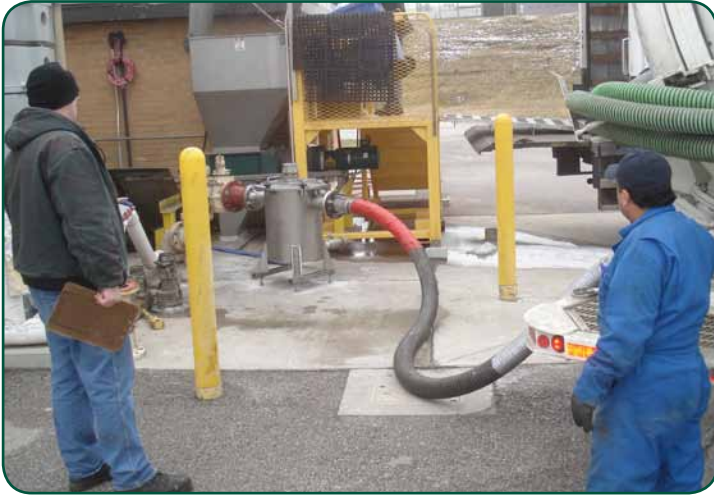
A grease truck unloads through the JWCE Heavy Object Trap and into a wastewater treatment plant's holding tank.