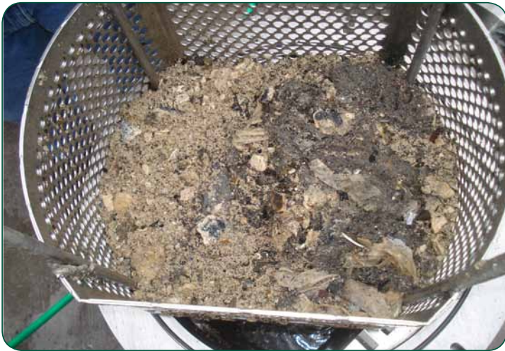
Heavy objects, rocks, silverware, rags and other debris drop or are washed into the perforated capture basket.