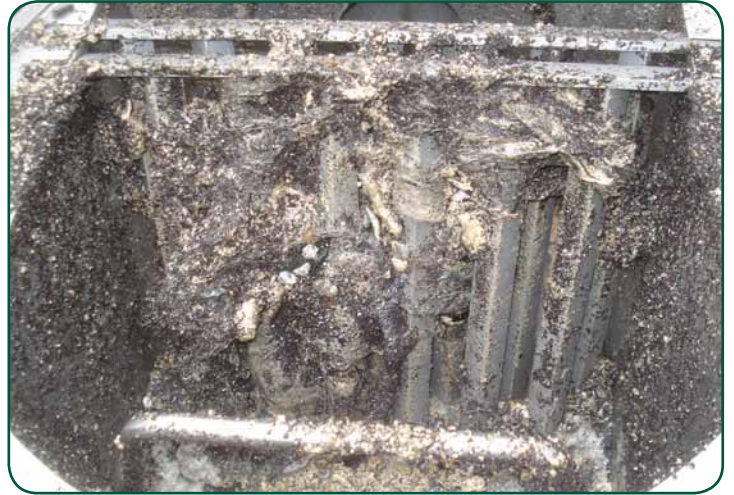
The screening bars use a unique design for max flow while capturing silverware, rags and plastics. A hot water washdown cleans the bars.