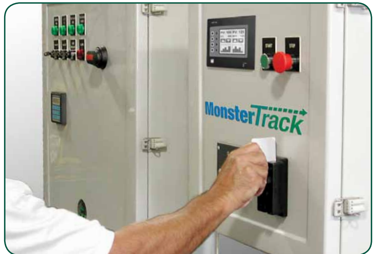
MonsterTrack billing controller features a card lock & receipt printer.