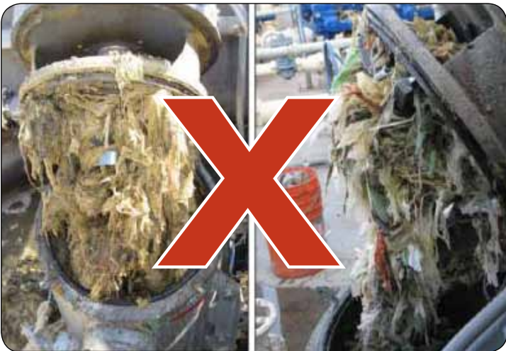
Macerators work poorly in grease/waste receiving applications.